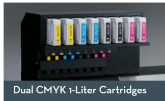
Dual CMYK 1-Liter Cartridges

The EJ runs optimally with Roland DG EJ inks in 4-color or 7-colors and high-capacity 1-liter cartridges. The result? High-volume printing and bold, exciting colors at costs up to 35% lower than the competition.