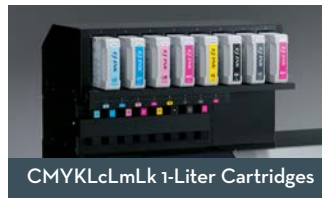
CMYKcLmLk 1-Liter Cartridges