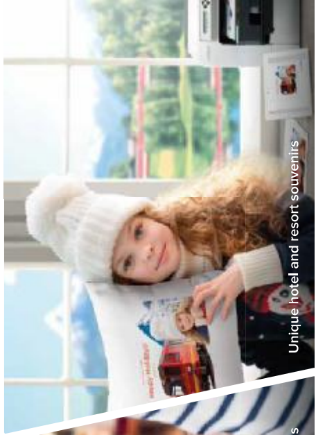
Unique hotel and resort souvenirs