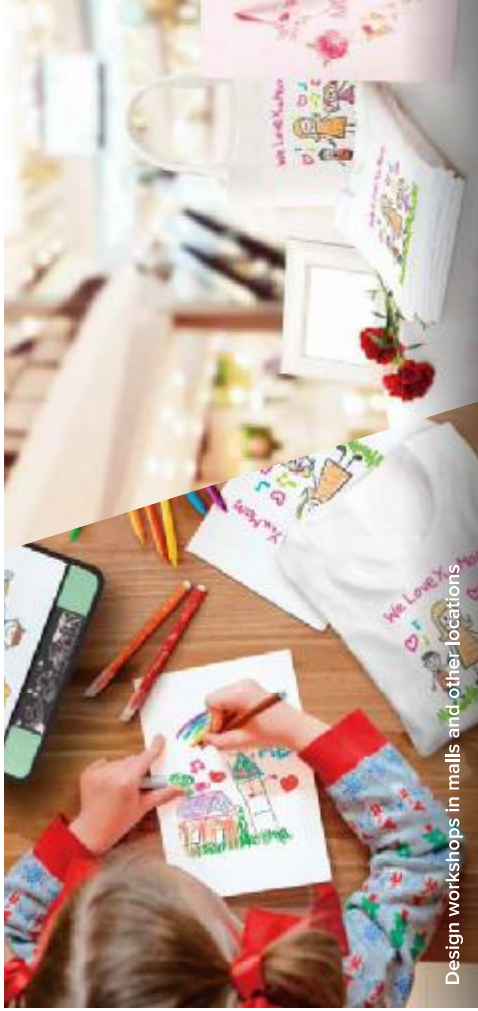
Design workshops in malls and other locations