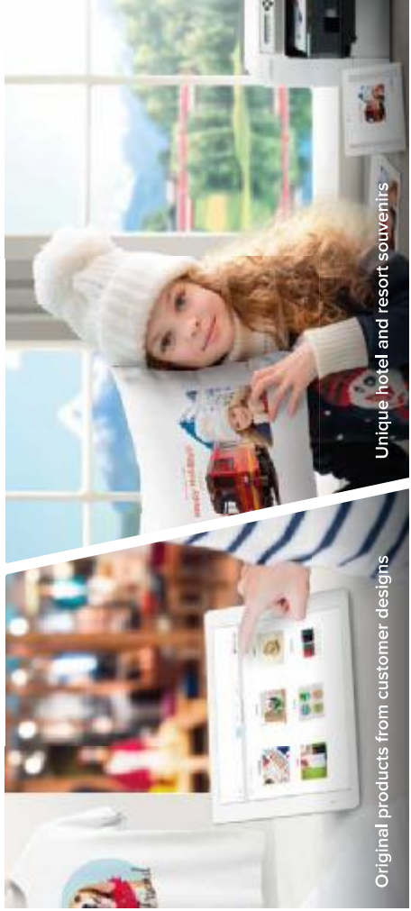
Original products from customer designs