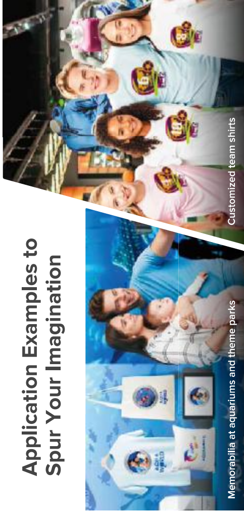
Memorabilia at aquariums and theme parks