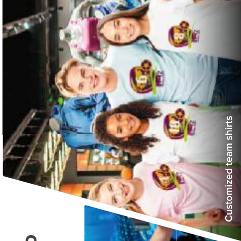
Customized team shirts